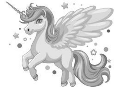
Unibel, the unicorn

However, she thought it could not be a baby horse as she did not live near any farm where she might hear a baby horse. Mia opened the door and went to the garden. The sound seemed to be coming from a nearby plant. Mia heard wings flapping but saw nothing flying away.