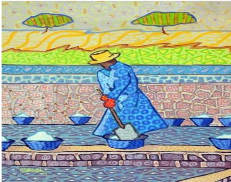
Pascal Lagesse Salt harvesting , 2014 Oils on canvas