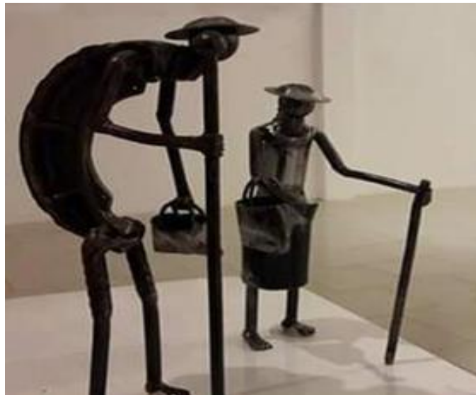
Jugulkessor Beekun Old Couple , 2017 Welding with scrap metals