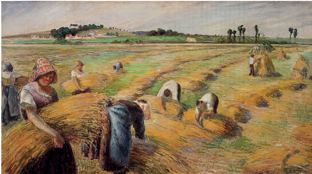
Camille Pissaro, The Harvest , 1882, Oil on canvas Dimension: 70.3 x 126 cm