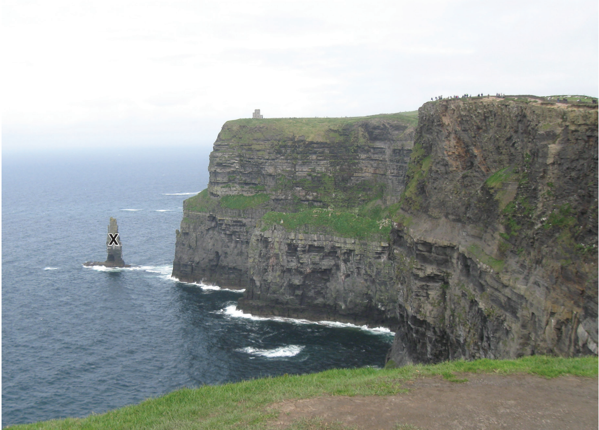
Fig. 4.1 for Question 4